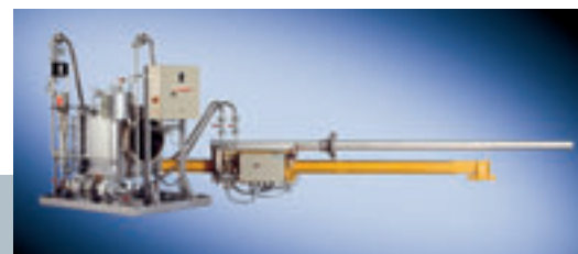
FLK-Gas Sample Probe