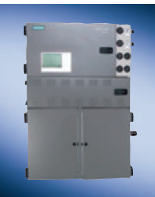
MAXUM edition II