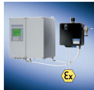
ULTRAMAT in field housing

The cooling of the probe is done by means of a special cooling liquid which allows gas sample temperatures up to 200 °C and therefore lies above the acid dew point of the flue gas. Buildup of condensate products and offtime due to frequent maintenance are prevented.